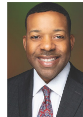
Shelton Gibbs IV Pulpit